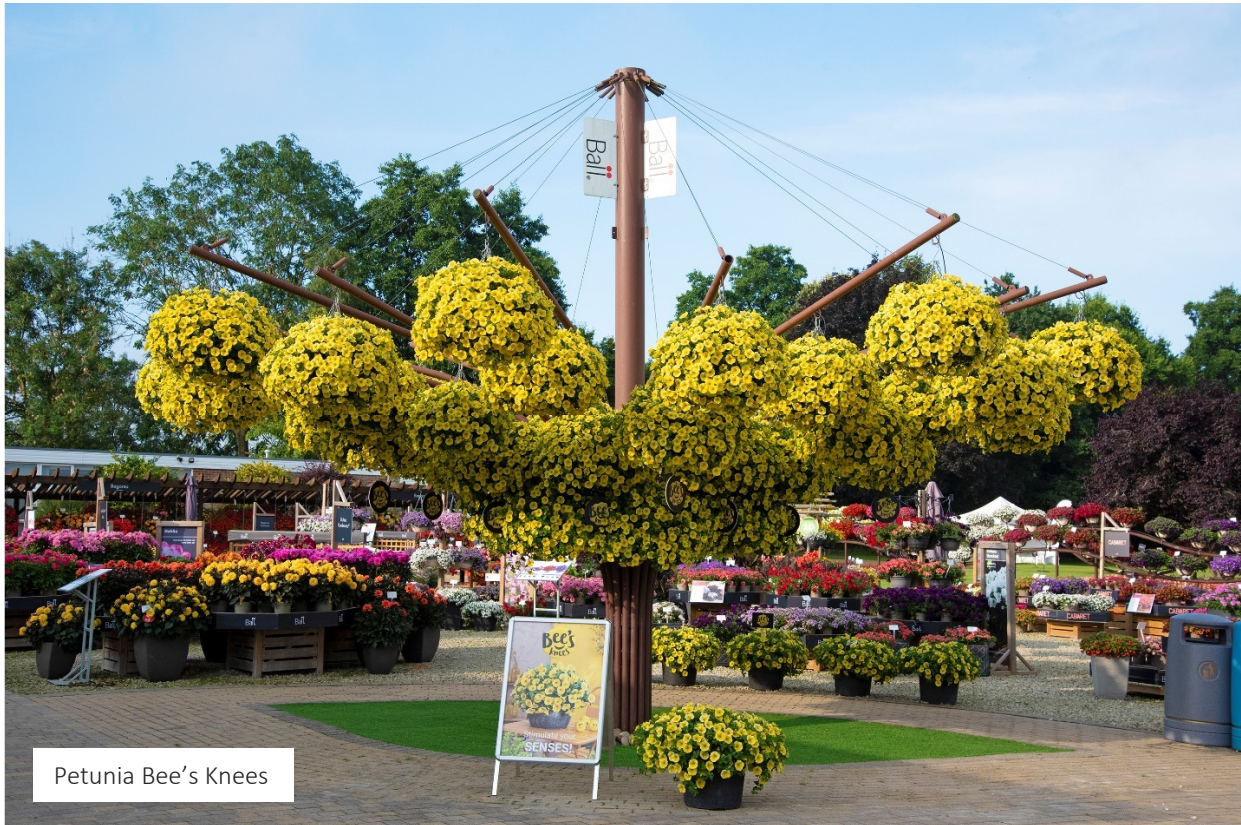
Petunia Bee's Knees

The Ball Summer Showcase in its Oxfordshire Trial Grounds has become one of the key trade events in the horticultural diary, attended by over 2,000 nurseries, retailers, landscapers and gardening media.