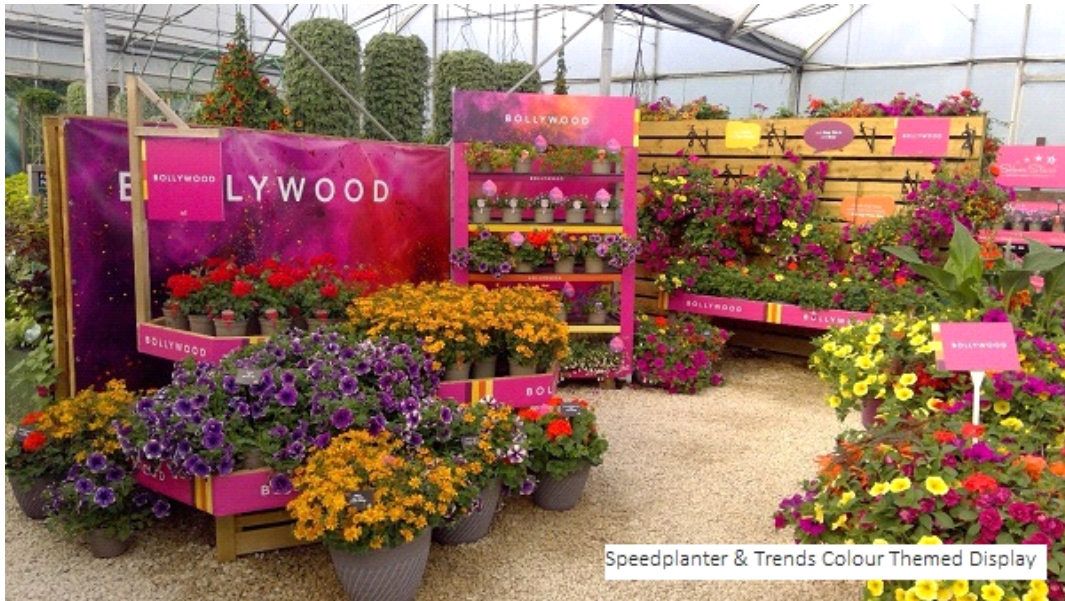
Speedplanter & Trends Colour Themed Display

“This Summer’s Showcase has been probably one of the best presentations for many years. The challenging weeks of cold wet weather leading up to the July event was a real test for the plant varieties, providing visitors a perfect opportunity to see real garden performance. We were delighted by how incredibly well the plants genetics stood up to the weather, testament to the amazing work of the plant breeders! It was also so encouraging to see how much the displays and trials are valued and utilised by growers, retail buyers and landscapers in planning for their 2025 season. The New Varieties Theatre was as always extremely well received, providing all those who came an exclusive preview of what will be new in the 2025 catalogues” Stuart Lowen, Marketing Manager