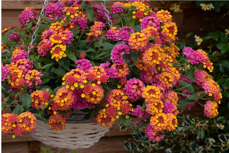
A stunning Lantana for a fruity-looking basket!

Our visitor's clear favourite at the Ball Colegrave Summer Showcase was this very special spreading, trailing Lantana, with abundant flowers, dark green leaves and a perfect habit for spectacular hanging baskets.