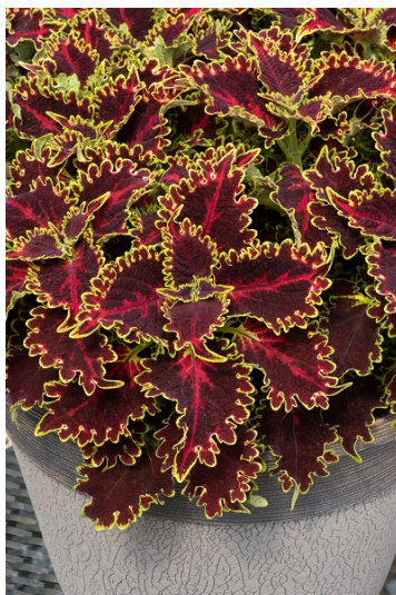
Colossal Colour without a Flower!

Coleus Coral Candy was the 2023 Summer Showcase favourite foliage variety, and this year our stunning new Coleus Solare Flare has grabbed all the attention. It just looked great all summer, so wasn't surprising there were blue flags in this container every day we had visitors.