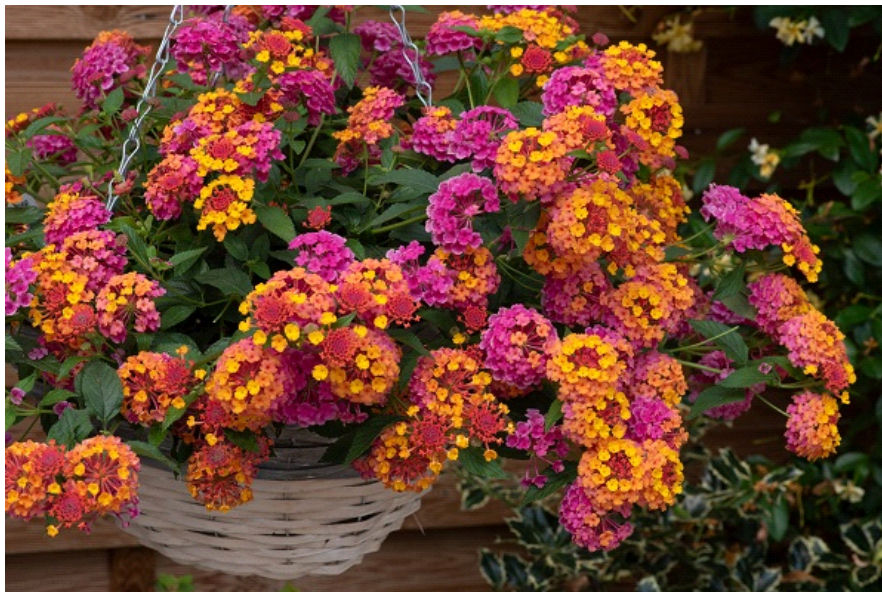
A stunning Lantana for a fruity-looking basket!

Our visitor's clear favourite at the Ball Colegrave Summer Showcase was this very special spreading, trailing Lantana, with abundant flowers, dark green leaves and a perfect habit for spectacular hanging baskets.