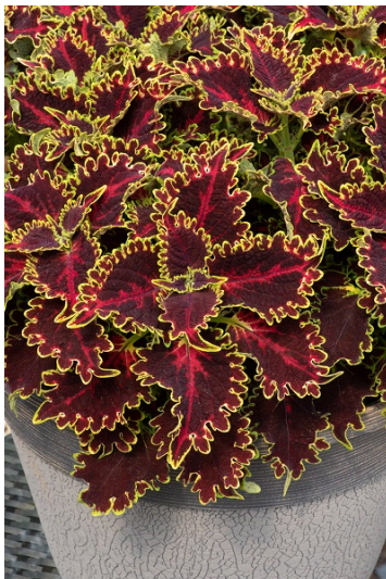
Colossal Colour without a Flower!

Coleus Coral Candy was the 2023 Summer Showcase favourite foliage variety, and this year our stunning new Coleus Solare Flare has grabbed all the attention. It just looked great all summer, so wasn't surprising there were blue flags in this container every day we had visitors.