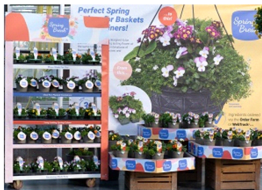
NEW Spring Break

This catalogue features an extensive range of Annual and Perennial varieties to provide a multitude of sales opportunities from early autumn 2025 through to spring 2026.